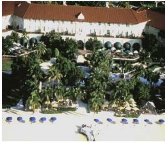
Pictured Left: An aerial view of the Wyndham Casa Marina Resort.

The map view below shows North and South Roosevelt Boulevard on Key West in relation to the airport. The “pushpin” is the Wyndham Casa Marina Resort on Reynolds Street. The alternate hotels are on North or South Roosevelt Boulevard.